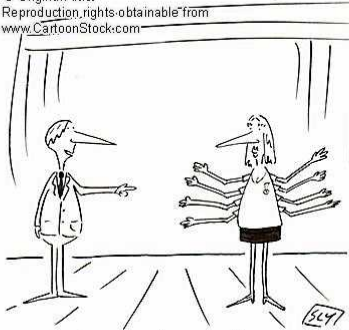
"Introducing the government's new, cost-effective nursing model..."

© Original Artist Reproduction rights obtainable from www.CartoonStock.com